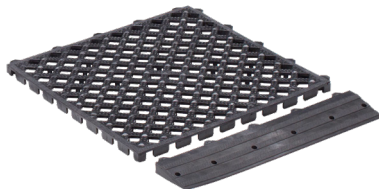
MultiPro Comfort - Open